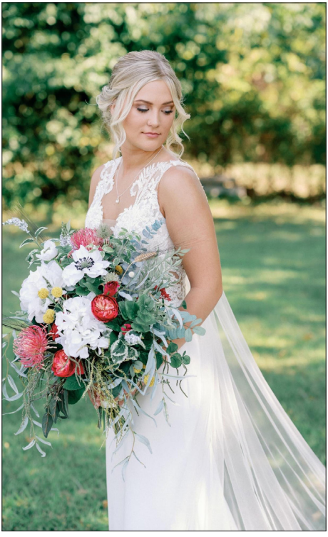
Hayes • from page 15